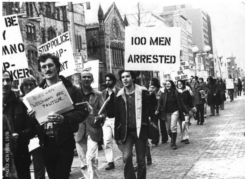
Protesting entrapment of gay men in bathroom sex stings at the Boston Public Library.

Two other panels will highlight key precedent-setting cases in GLAD's 30 year history. In April, we will focus on GLAD's 1998 win at the U.S. Supreme Court establishing that all people with HIV are protected under the Americans with Disabilities Act. November 2008 will be the fifth anniversary of the