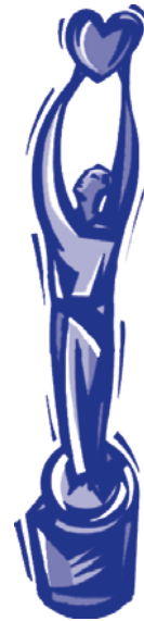
GLAD received the 2004 Greater Boston Business Council's Founders Award