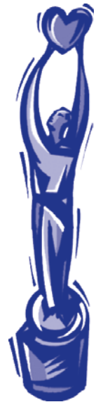
GLAD was the Grand Marshal in Boston's 2004 Gay Pride Parade

Disability insurance: In spite of some improvement in their condition, some people with HIV remain unable to work due to severe fatigue and side effects from medications. GLAD continues to take on disability insurers that terminate benefits for people in this situation. Most recently, we have filed an appeal on behalf of man who was cut off by his disability insurer even though his doctor explained to the insurance company that he is a "very sick patient whose body is under significant assault from advanced HIV disease." ▼